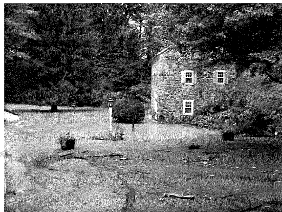
The Bushkill visits the Stone House

Some of the recent restoration accomplished at the house includes major roof and porch repairs, refurbishing of the second story artifacts room, temporary stabilization of the summer kitchen and weather proofing kitchen entrances. In the near future we will address the deterioration of the ceiling in the back parlor.