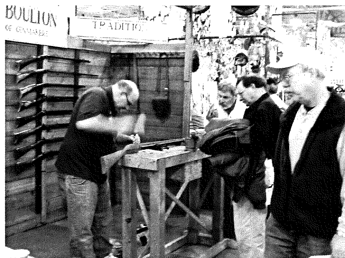
Our gunsmith at work