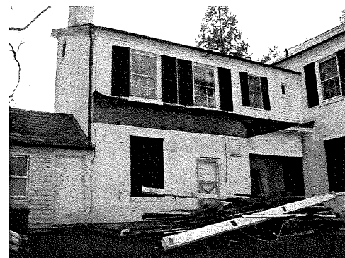
J.J. Henry House refurbishing