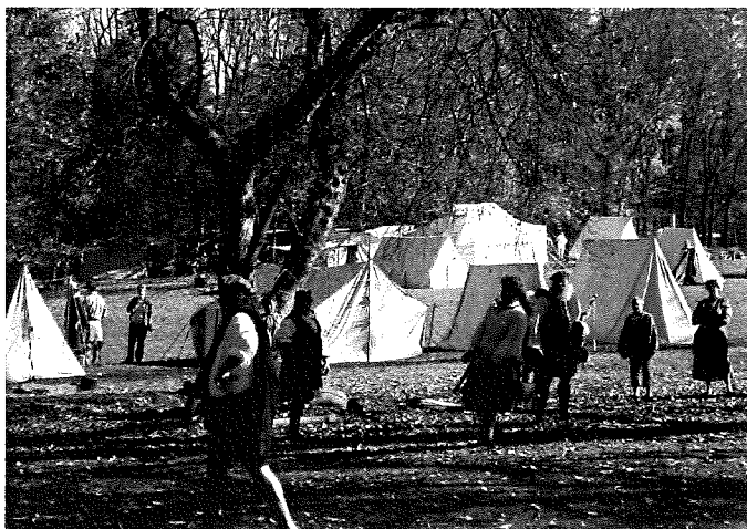
Our 2004 Frolic